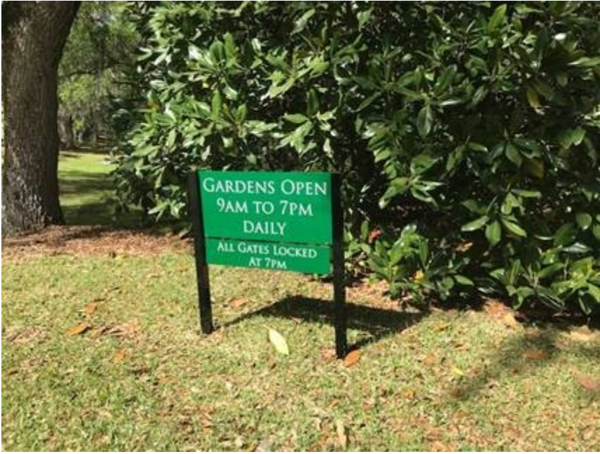
The new sign about the gates being closed has been installed