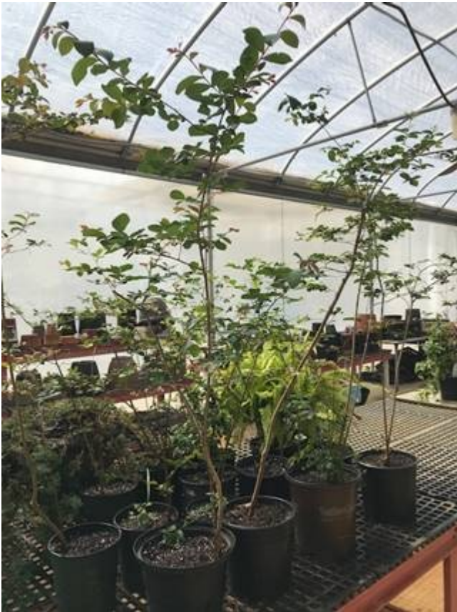
Starter Crepe Myrtles

We hope to be as successful as last year. All monies go to the Garden Program for our "wish" list. We appreciate any support you can give us!