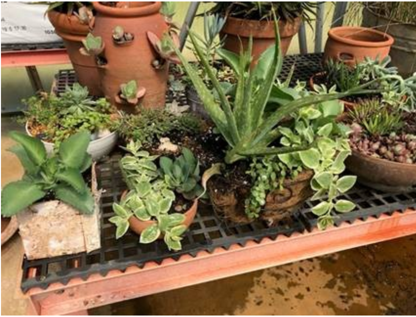
Various assortments in pots