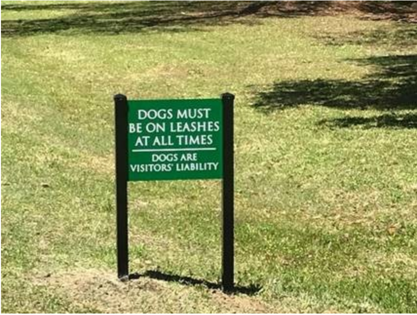
As well as a sign at the entrance pertaining to dogs,