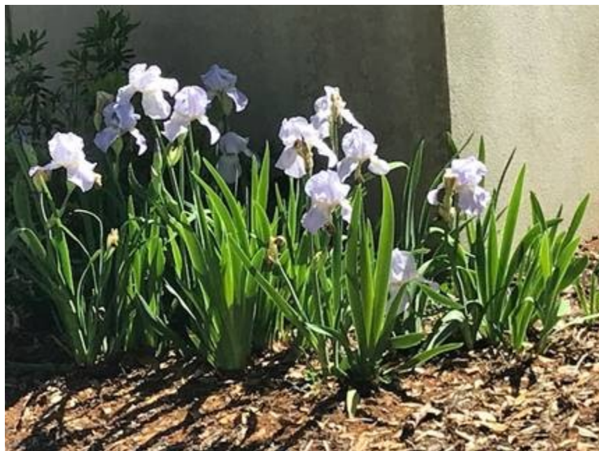
Russo Iris in Cloister

The Volunteers continue to have a full load of tasks with warm weather coming on strong. We have almost completed the replacement of plant materials that were destroyed by the ice and snow storm several months ago. The weeds are loving the warm weather and we are struggling to keep up! The huge job of the Azalea and Camellia feeding program is underway and an assessment of the vines tells us they are ahead of us again. This past month, several bad rain/wind storms covered the grounds with moss and other debris. There is never a day we do not have plenty to maintain.