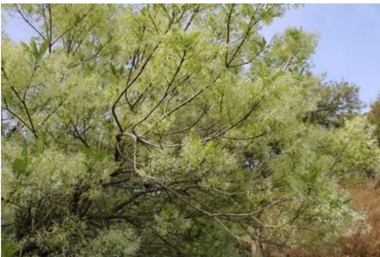
Close up of Fringe Tree (Father Jonas)