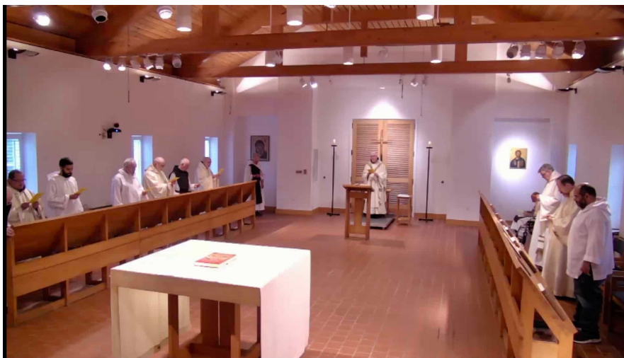
The Monks at services in the “Church” in the CBL Library

“Work has begun on the inside of the monastic church following the completion of the recent extensive outdoor renovations. The work indoors consists of painting, repairing the floor, putting in a new air conditioning system, a new sound system, and alarm, among other things. This work necessitates the monks leaving the church for next few months and relocating the recitation of the Divine Office and the celebration of the Eucharist to the