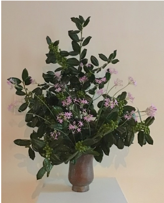
Arrangement in the Church