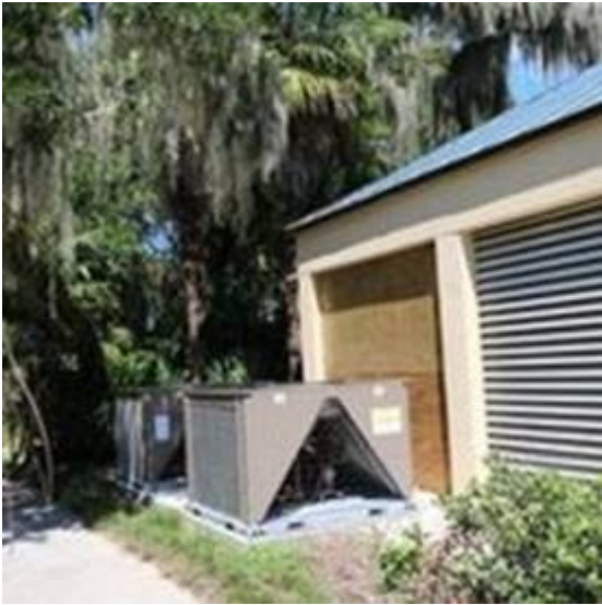
The new HVAC for the Church