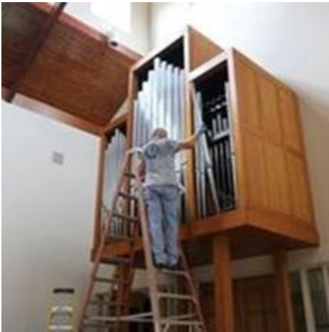
Cornell Zimmer (the original commissioned maker of the Pipe Organ) cleaning the pipes and box casing