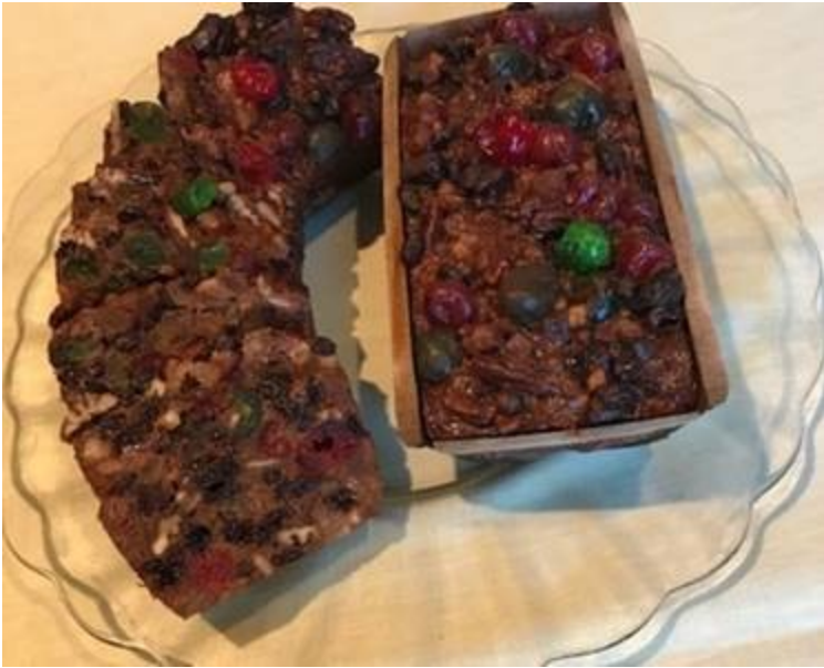
Wonderful Fruitcake for Sale