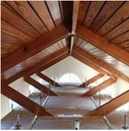
Ceiling inside the Church