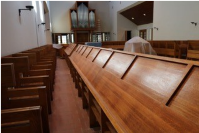
Refurbished Choir Stalls