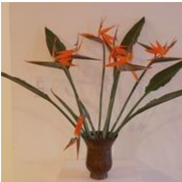
Bird of Paradise from Greenhouse

“Working in a Garden makes us keep fit, to connect with others, to enjoy and be part of nature and to revel in color, wildlife and beauty. Simply contemplating nature helps to rest and recharge our brains.” The Well-Being Garden