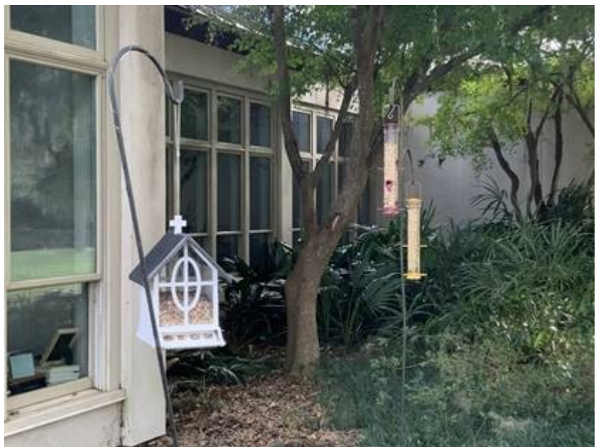
Birdhouse in Cloister