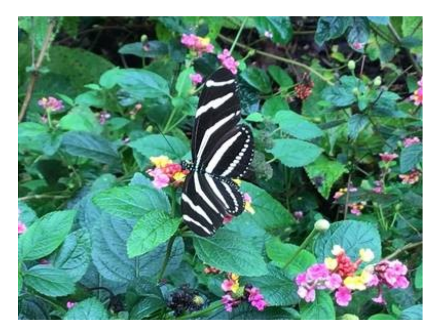
Butterfly in Lantana at Store