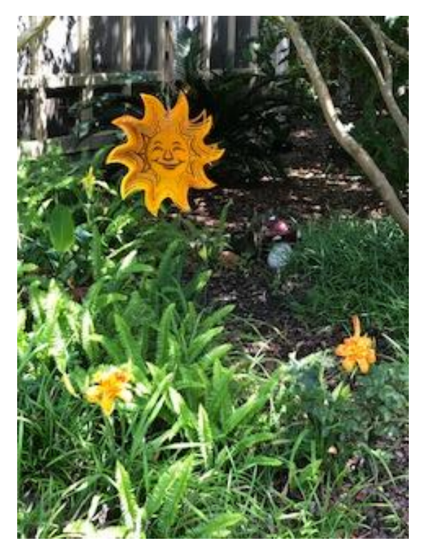
Ferns and lilies beneath a smiling sun