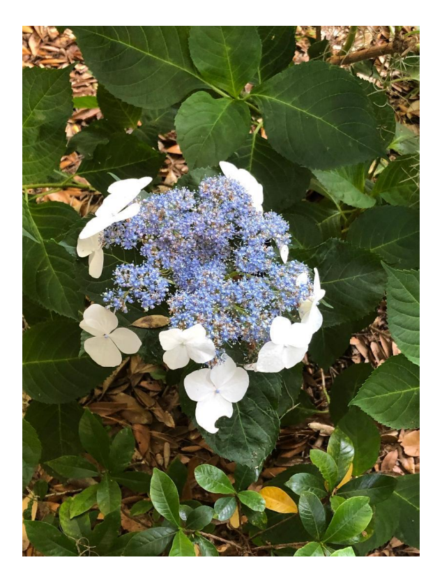
A close up of a Lanarth White Macrophylla Hydrangea Bloom