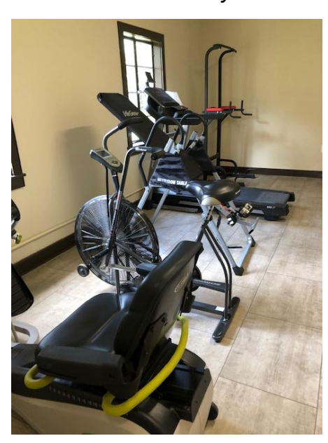
Renovated exercise room