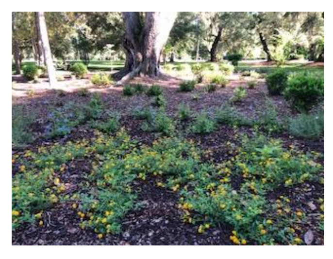
The lantana and plumbago in bloom.