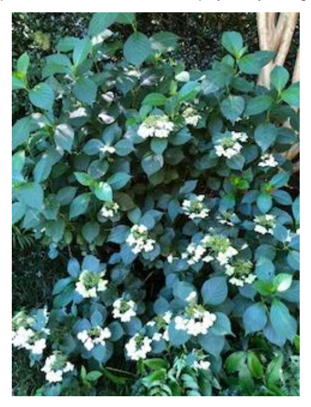
Lanarth White Macrophylla Hydrangea Bush