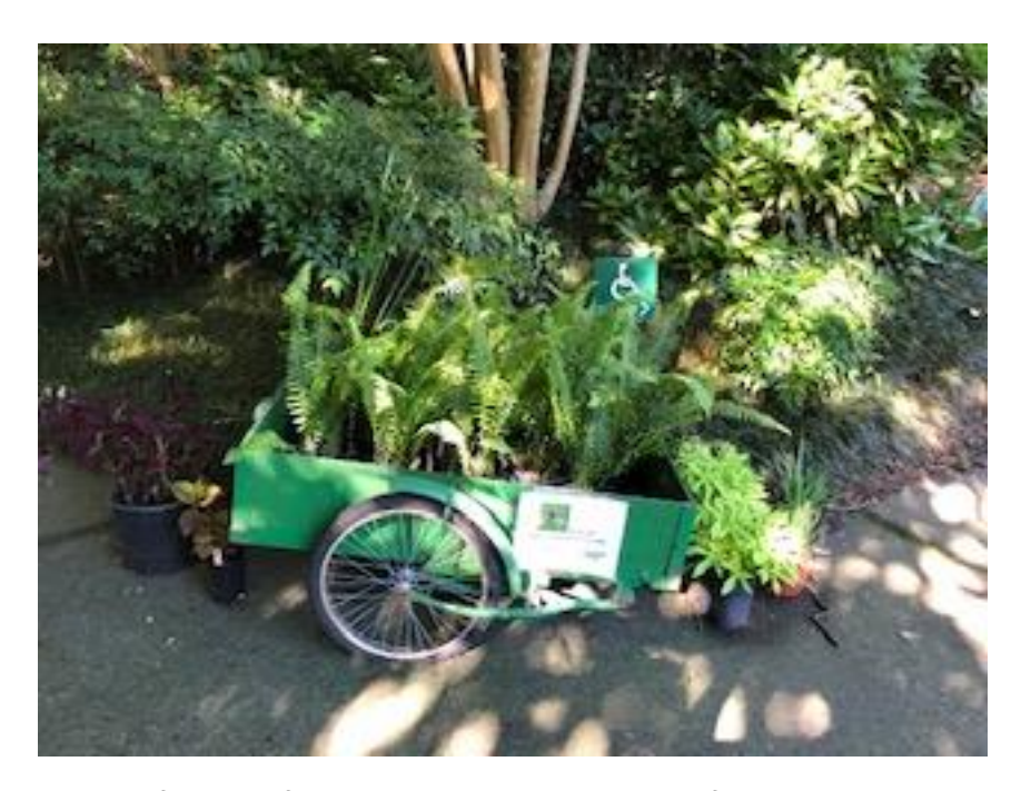
A loaded wagon of plants from the greenhouse team for sale at the entrance to St. Clare's Walk.