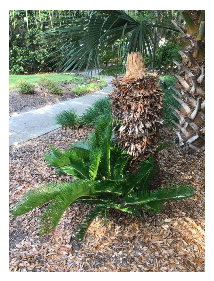
New Sago Palm sprouts