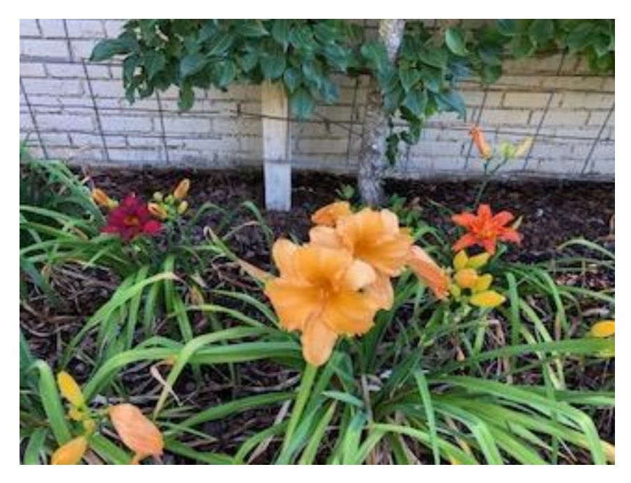
Assorted lilies in shades of yellow, orange, and red.