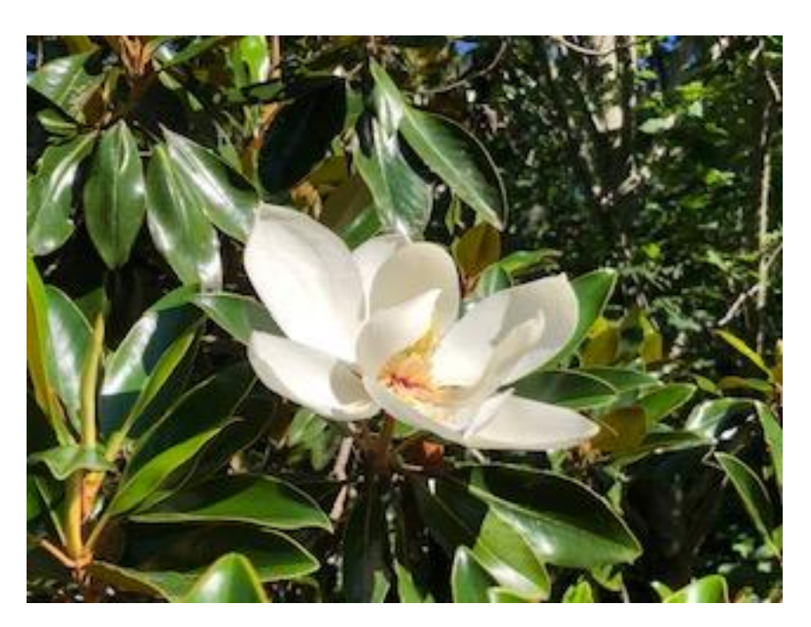
A solitary magnolia bud on a tree near the Columbarium.