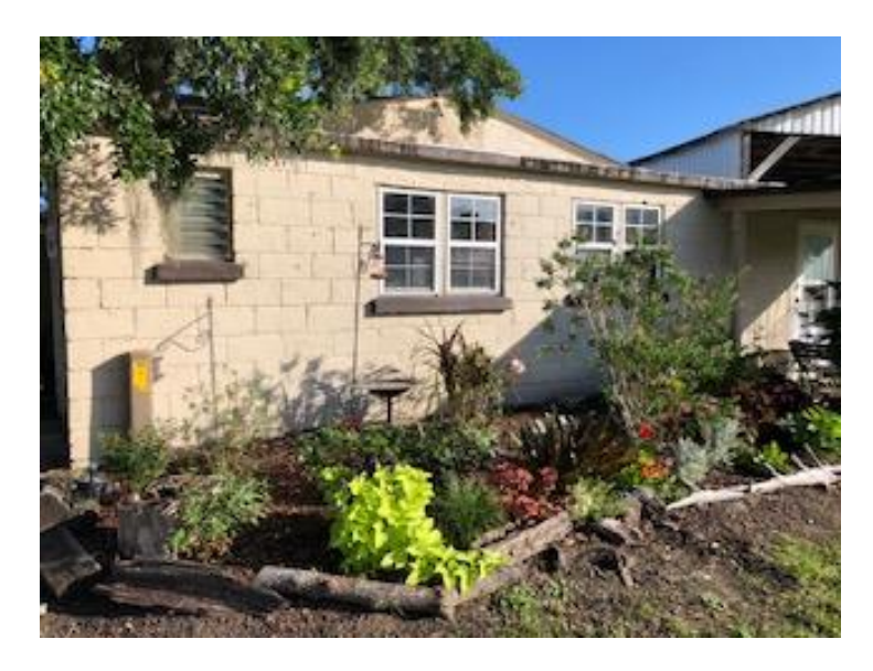
Recently updated landscaping at the volunteer shed is loved by the hummingbirds.