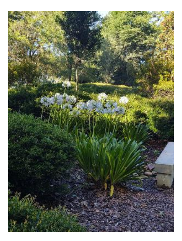
White agapanthus near the Columbarium bench.