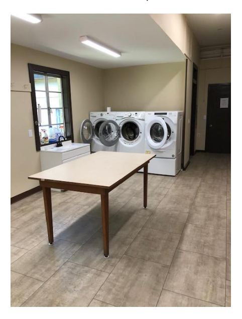
Renovated laundry room

The laundry room, as well as the exercise room, have recently been renovated.