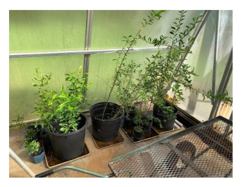
The 19 donated citrus plants from the Katzberg's in the greenhouse.