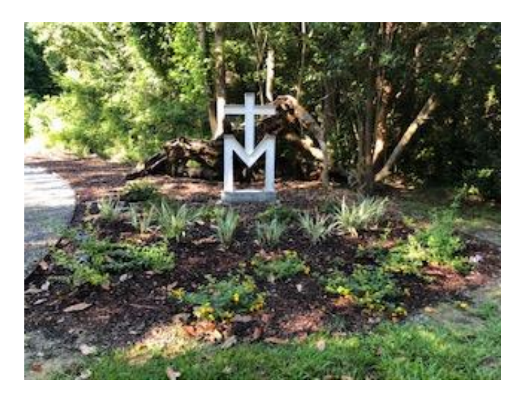
The area in front of the Mepkin sign is filling in nicely.