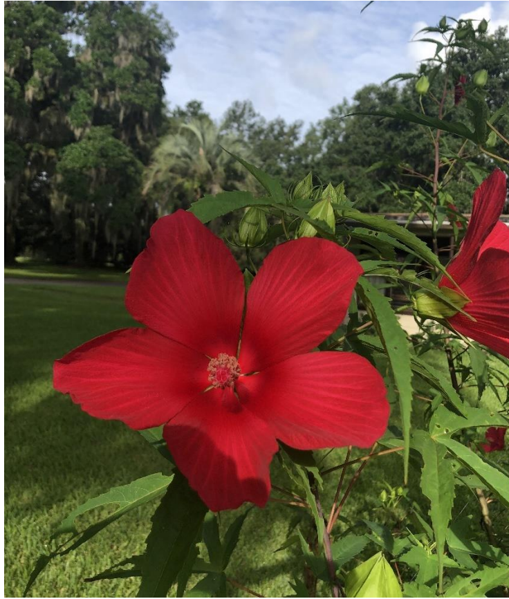
Red hibiscus bloom