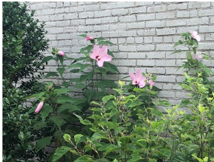
Pink hibiscus bloom