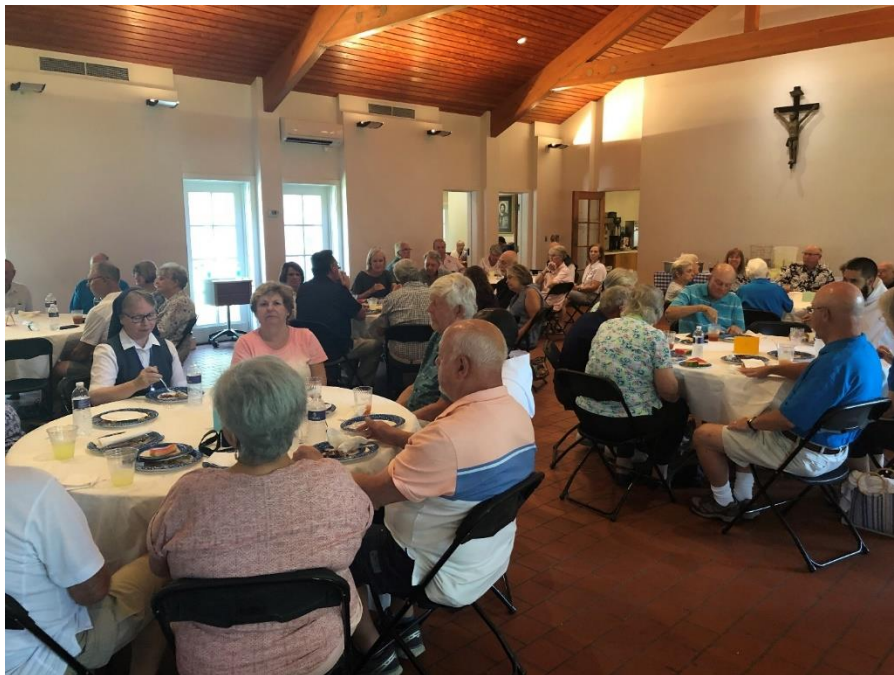
Mepkin volunteers at the luncheon