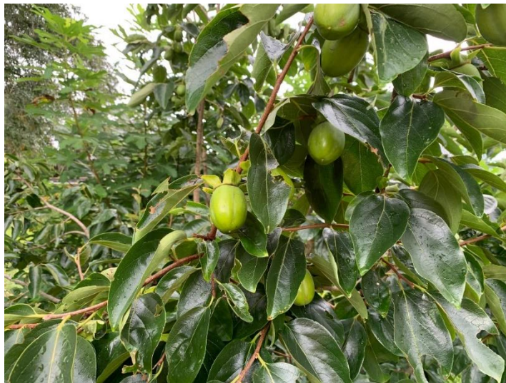
Close up of persimmons

We have lots of figs that are growing slowly. The birds are enjoying them. The huge fig that is adjacent to the gator barn is referred to as Brother Joseph's fig. It has lots of small figs that are very tasty.