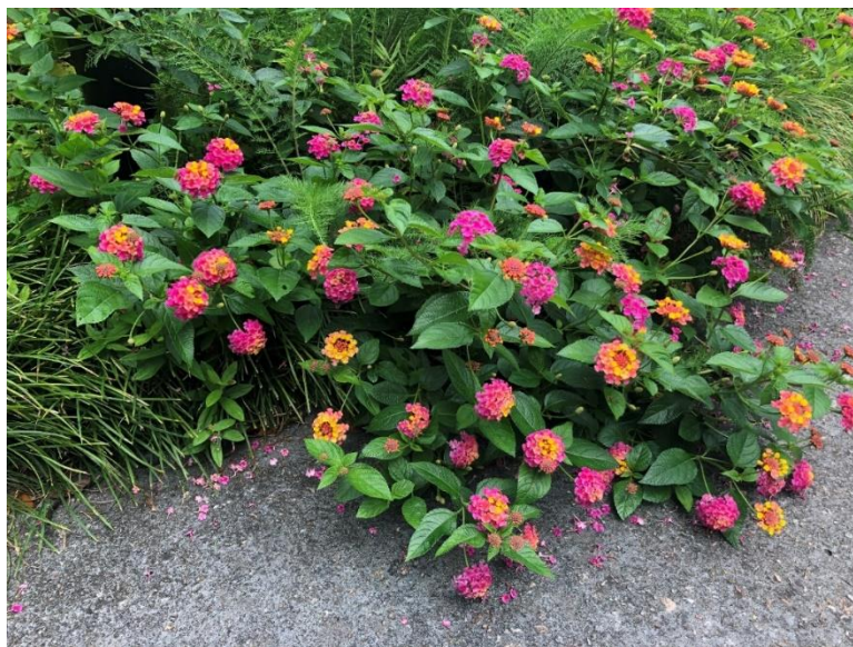
Colorful lantana along the walkway