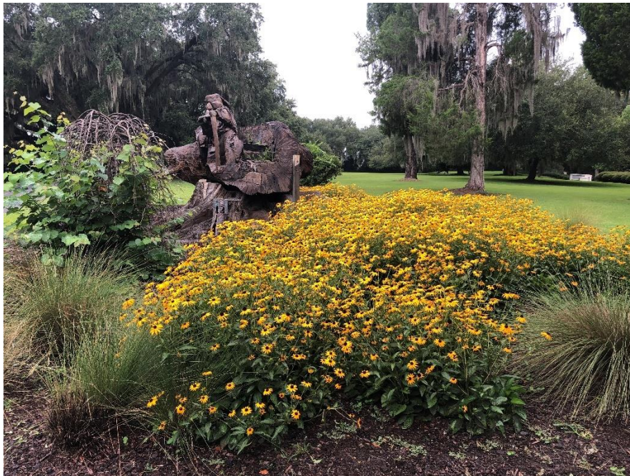
A sunny patch of Black-eyed Susans