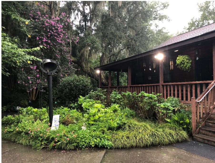
The newly pruned Gift Shop entrance