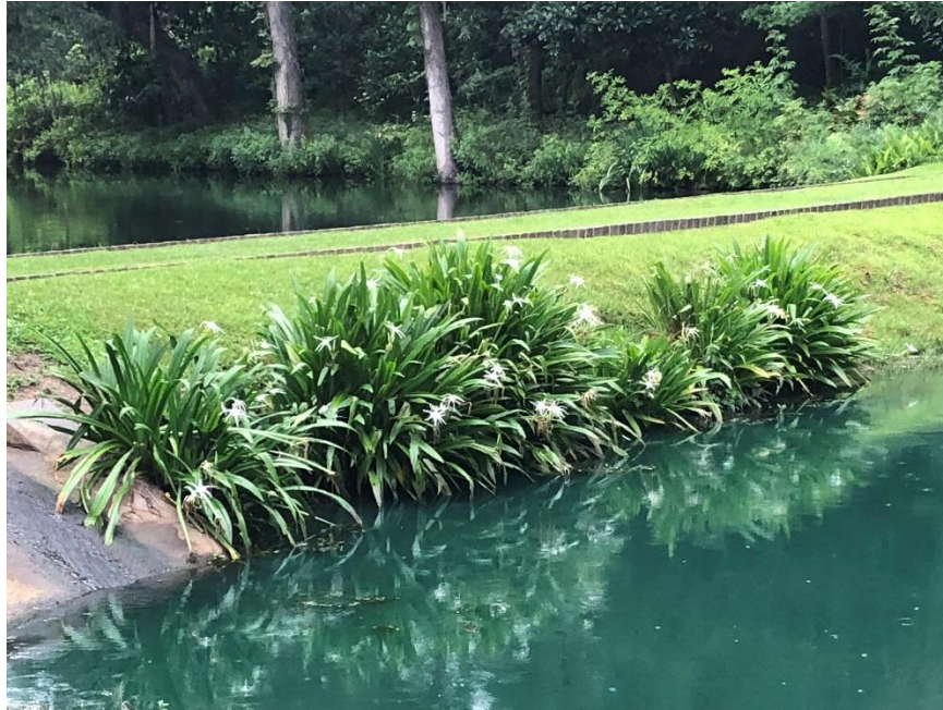
White lilies blooming by the pond