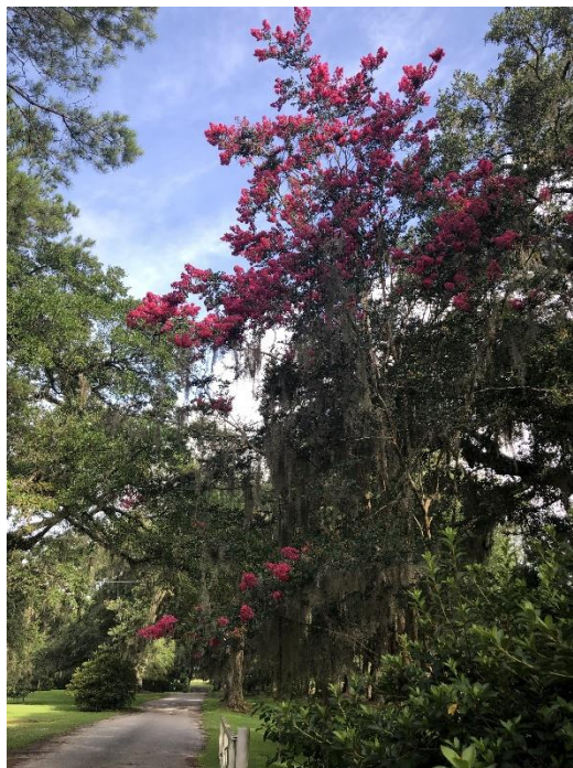
Crepe Myrtle along the drive to Luce Gardens

NOTE: I've received some feedback that the Monthly Maintenance section is a helpful reminder for readers on when they should do things around their own garden. I'm looking to put together some type of calendar and am reaching out to our readers for recommendations. If you have any thoughts, please reach out. Thank you!