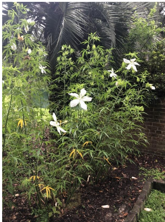
A close up of a white hibiscus near the Luce Gardens Gate