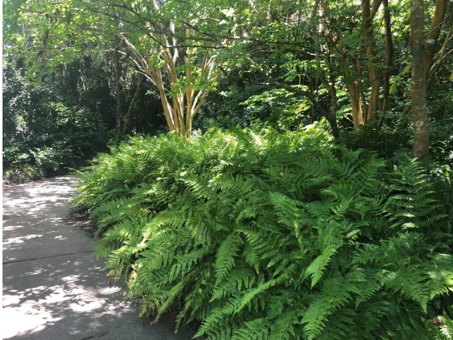
Ferns along the shaded walkway