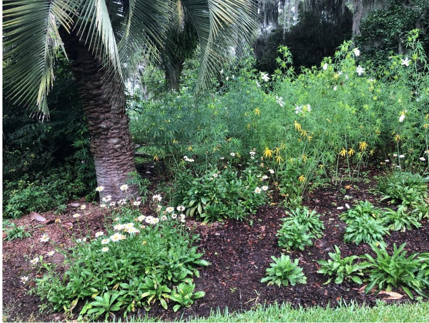
Angelic white flowers of daisies and hibiscus