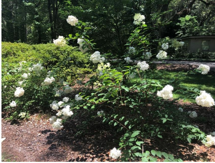
Fluffy white oakleaf hydrangea