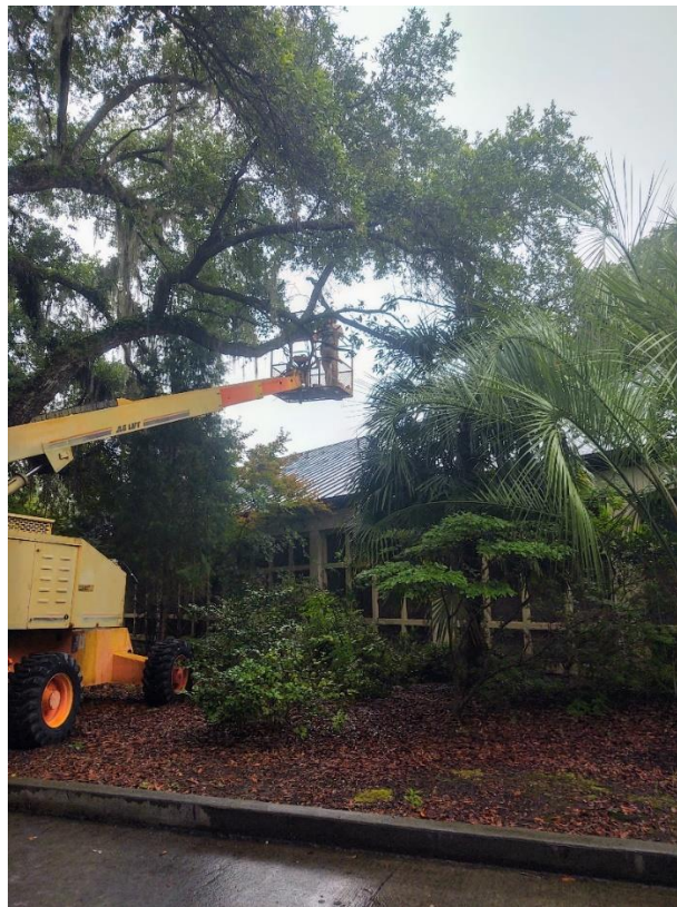
Cleaning up the trees by the Cloister