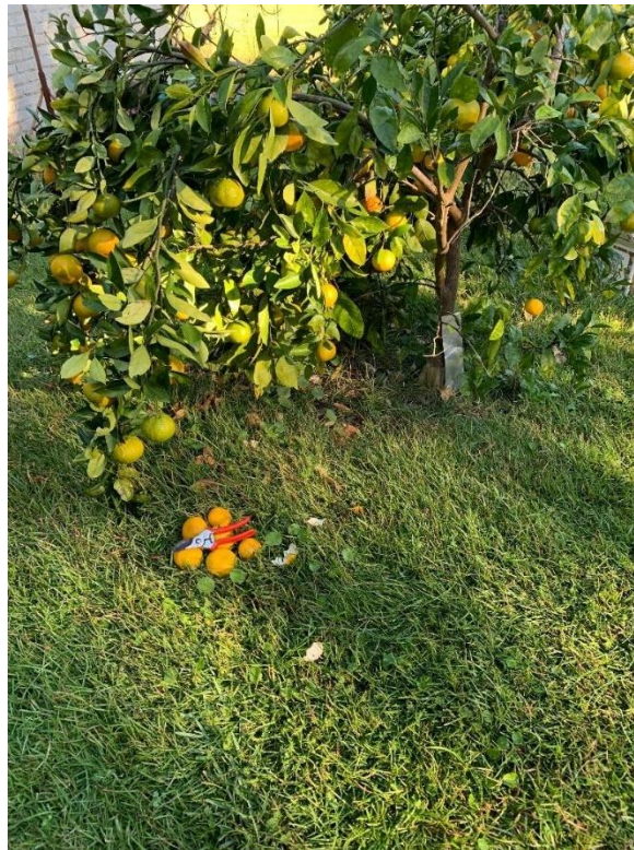
Oranges almost ripe bending the branches

I wondered when the cool weather would come, but here it is. Howard