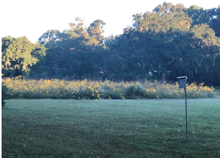
The morning sun glows on the last of the sunflowers in the Labyrinth. This picture was taken at the beginning of October. The Labyrinth is now back to green, with some white plumes.