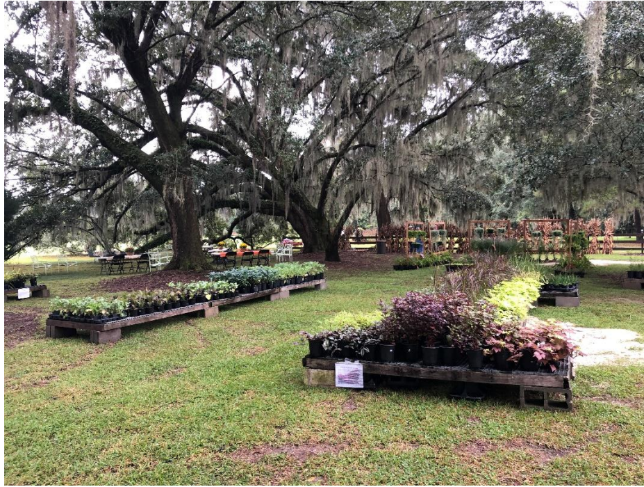
The large variety of plants for sale