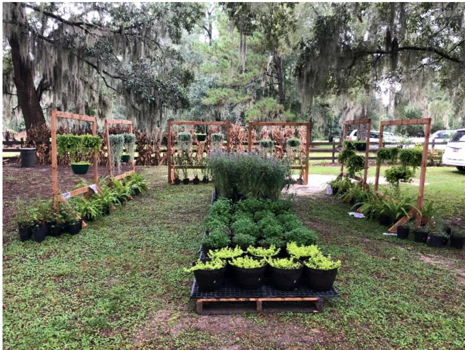
Hanging baskets and other plants