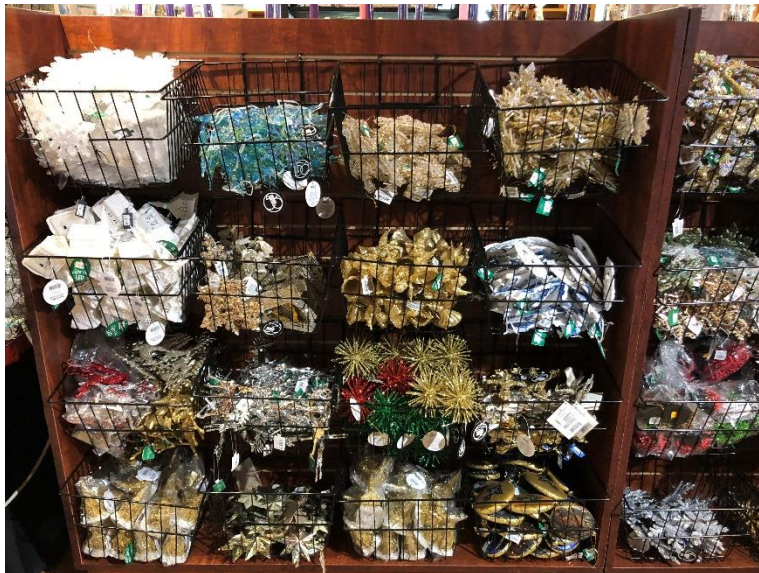
Bins of sparkling holiday ornaments waiting to be hung on the Christmas trees

It is beginning to look a lot like Christmas in the gift shop. Angel and her team have been busy decorating the store for the Creche Festival and the Christmas holidays. Volunteers are still needed in the store for the Creche Festival. They are looking for help with bagging purchases, restocking shelves, and assisting customers with their purchases. Please contact Angel at angel.franks3@gmail.com if you can help.