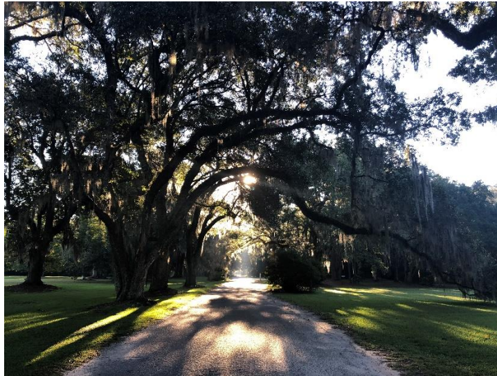
The sun filtering through the oak trees on a fall morning

The garden team is working hard to get Mepkin ready for the Creche Festival. In addition to Festival planting prep, the gardeners will also do general cleanup, such as raking leaves, turning over beds, protecting plants with mulch, and cutting back dead limbs. Roses can be planted now and fertilized. Any crowded perennials should be divided. After Mums have bloomed, cut them back to 5" to the ground. Hold off on pruning shrubs until the dead of winter. Spray 2-4D, broadleaf weed killer in the grass to kill any clover.