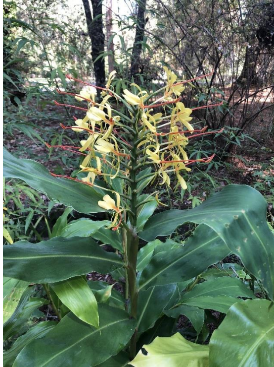
Yellow Ginger Lily