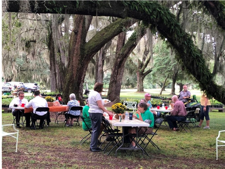
Volunteers enjoyed an al fresco BBQ lunch