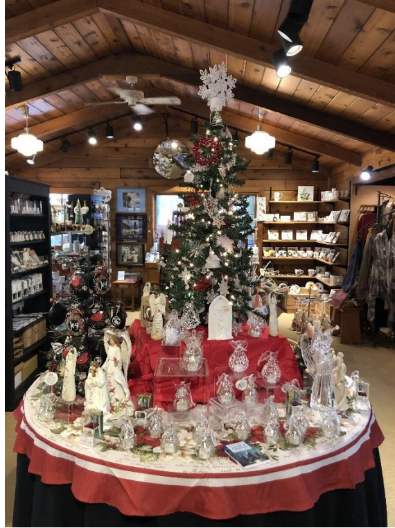
A tabletop Christmas tree surrounded by beautiful angels