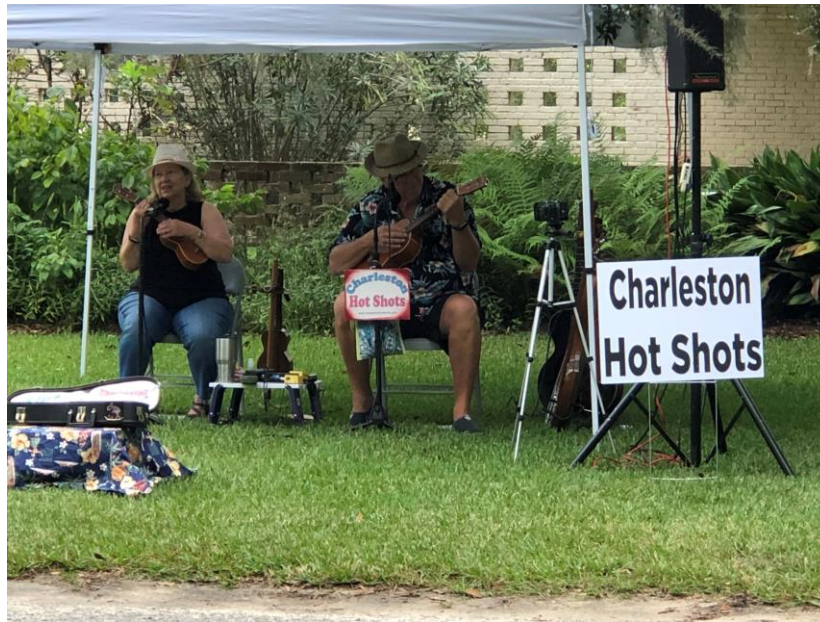
The Charleston Hot Shots, with their ukuleles