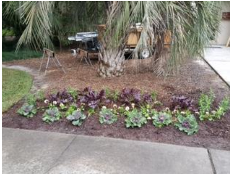
Fresh plantings in preparation for the Creche Festival