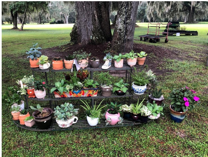
Succulent dish gardens