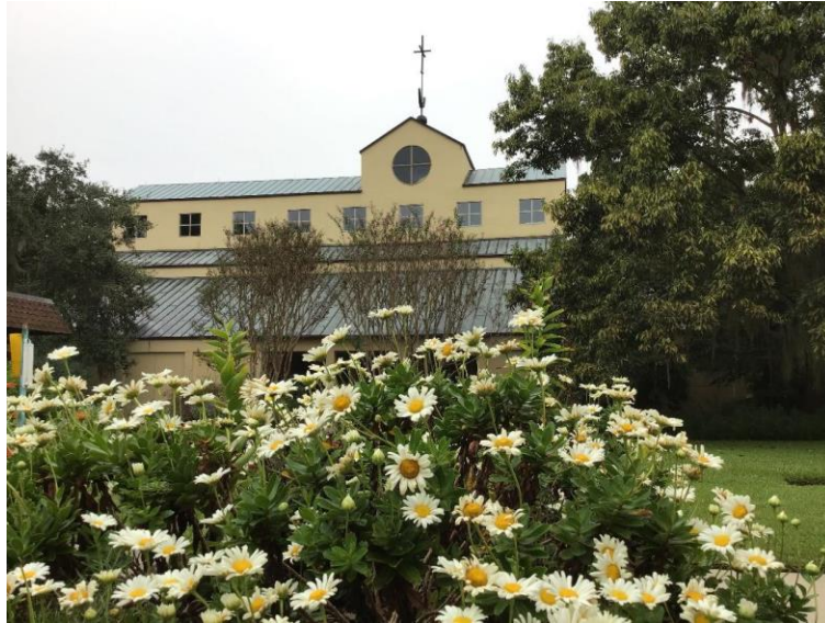
The Monastery stands tall behind the daisies