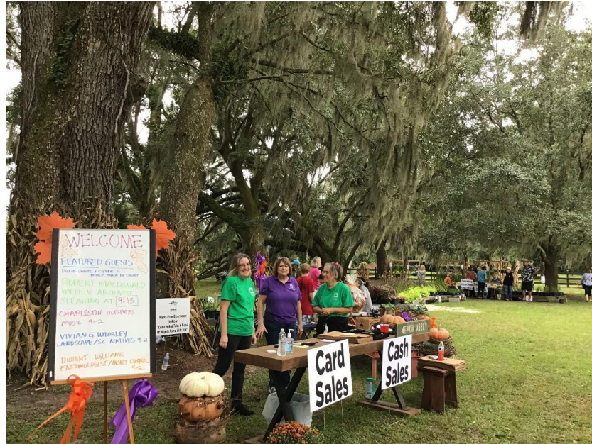
The welcome sign and sales desk

The day of the Fall Plant Sale started off cloudy, but the sun broke through the clouds to provide a beautiful day. It was another successful event at Mepkin.