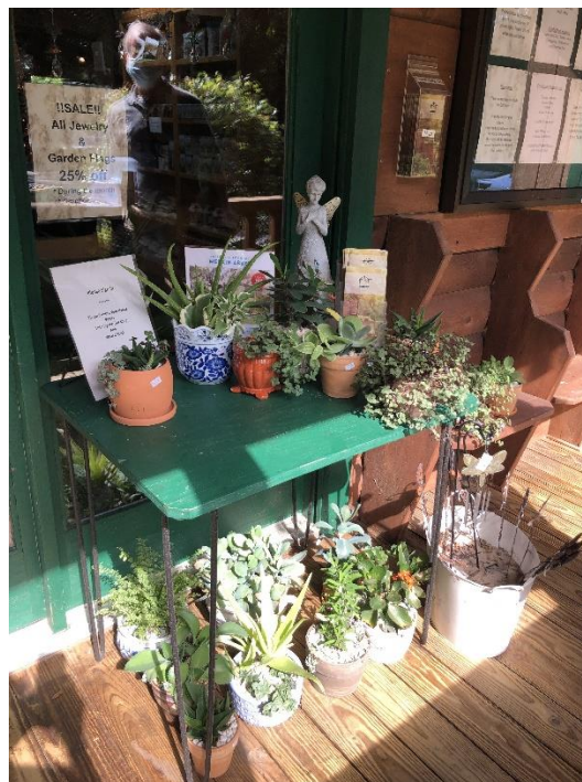
If you could not make the Plant Sale, the gift shop has succulent dish gardens for sale