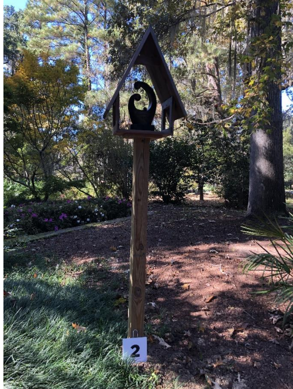
This simplistic wooden creche from Ecuador is shaped like a bird house