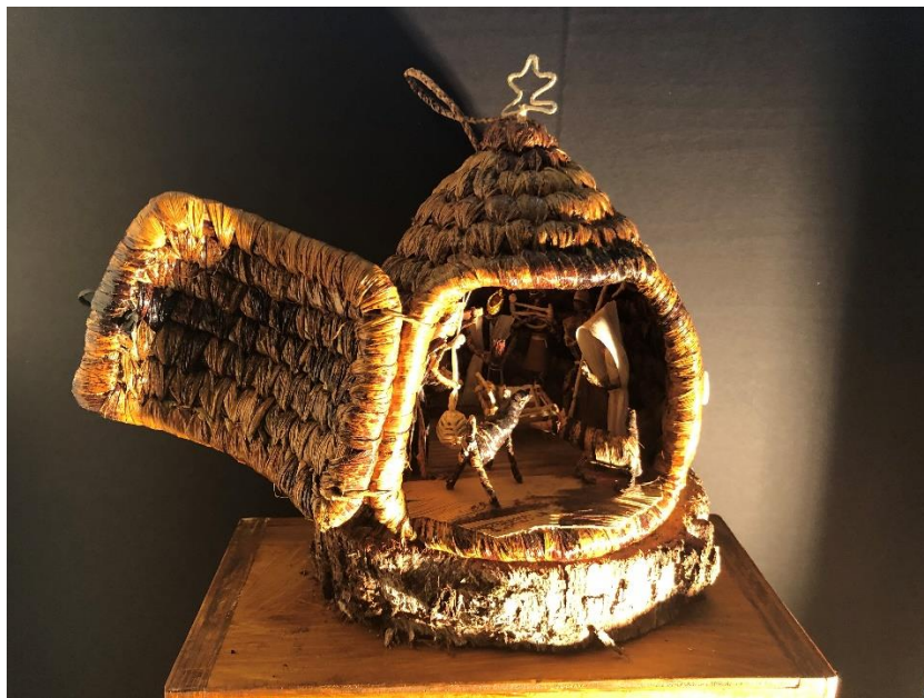
Woven of banana leaf fibers, this creche from the Congo resembles a beehive