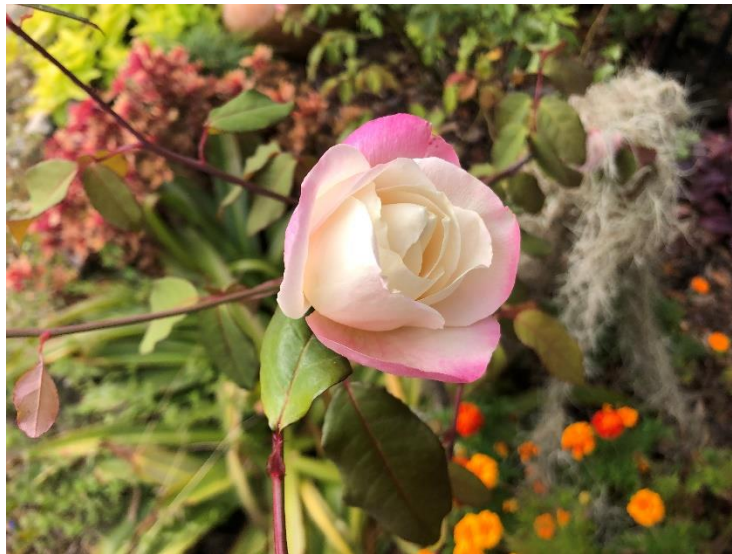
A perfect late blooming rose with a backdrop of fall color (taken outside volunteer break room)

In addition to keeping the grounds looking tidy for the Creche Festival, the gardeners are also doing general garden cleanup, such as raking, picking up tree limbs and Spanish Moss, and cutting back volunteers on trees. There are also bulbs to be planted this time of year for the spring flowers.