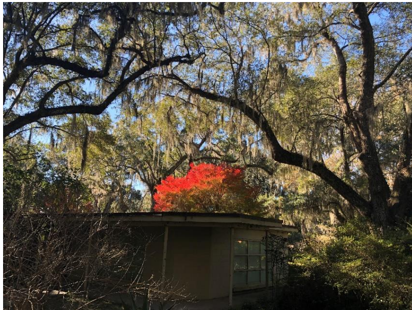
The fiery red maple ablaze on top of the Administration Building