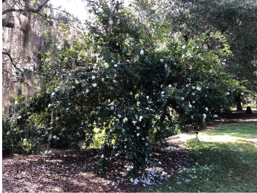
Blooming White Camellia