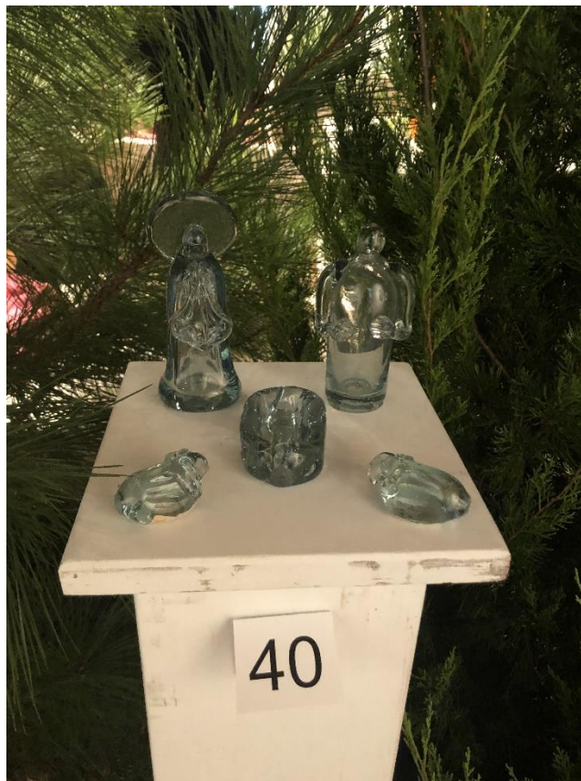
A glass creche from Guatemala