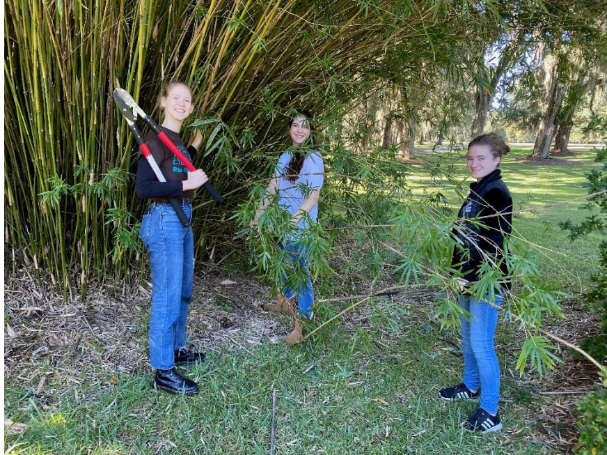
Cutting back the bamboo at the four corners