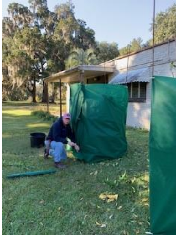
The orange trees are being tucked in for the winter