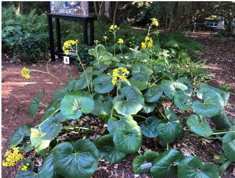
The tractor seat in bloom