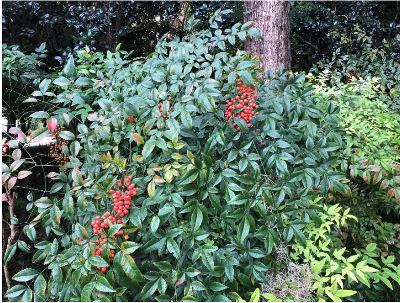
The Nandina berries lining the pathway are starting to turn red