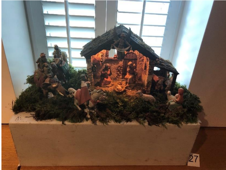
A traditional creche from Italy