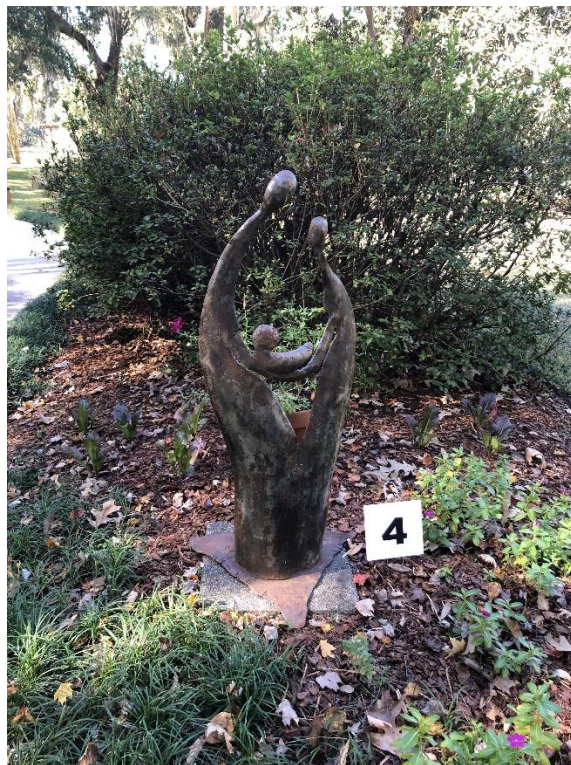
Here's another simple, but stunning creche from Dan Howachyn, from Black Mountain, NC, entitled "Steel Nativity"