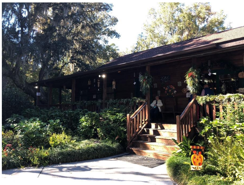
The finished Gift Shop entrance