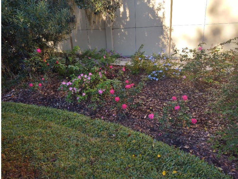
A second round of blooms beside the church