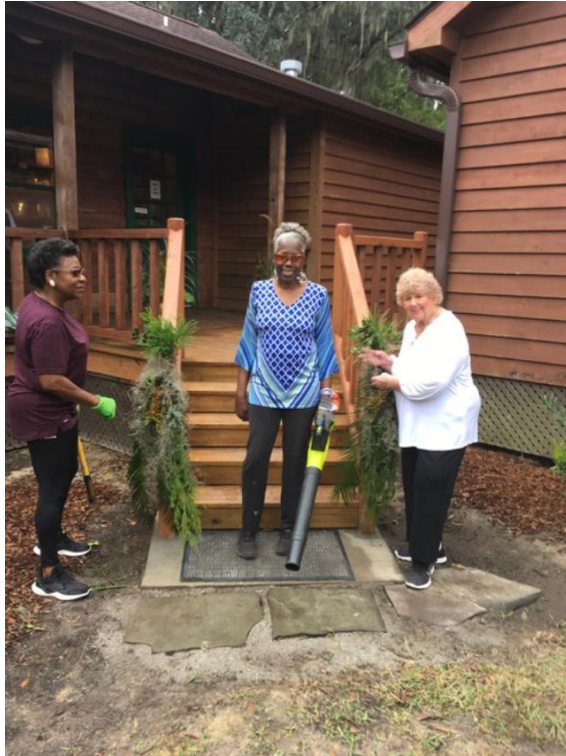
Decorating the new back steps