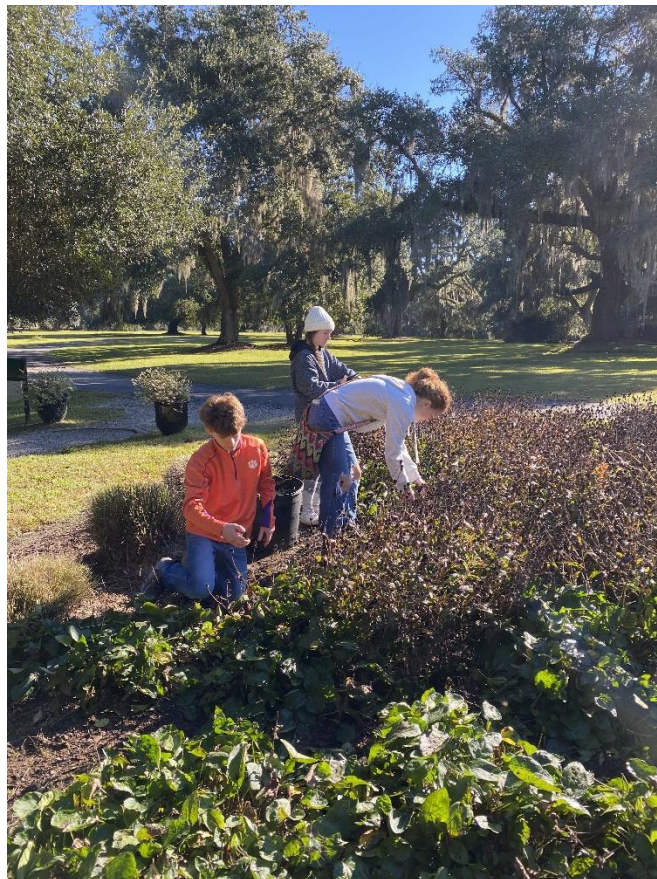
Cleaning up the dead Black-eyed Susan's at the wooden statues