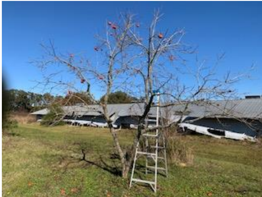
The season is over