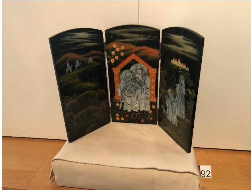
Mother of pearl inlays spotlight the central figures on this creche from Vietnam